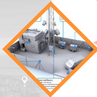
Ja-Square Site Monitoring Solutions

The installation of fiber optics connectivity from the residences or office buildings telecom closet up to the individual apartments or offices.