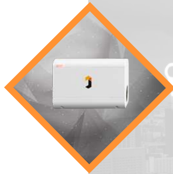
smartlife Smart water Meter

The smart power/electrical meter is a remotely controlled SIM card operated circuit breaker and metering device which aids consumers and governments to remotely switch the power consumption.