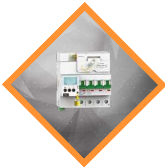
smartlife Smart Power Meter

The smart power/electrical meter is a remotely controlled SIM card operated circuit breaker and metering device which aids consumers and governments to remotely switch the power consumption.