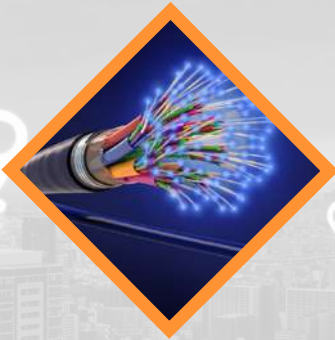
UMRT Fiber Optics