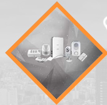
smartlife Home Automation & Security

The smart water meter is a remotely controlled SIM card operated water valve and metering device which aids consumers and governments monitor real-time water consumption.